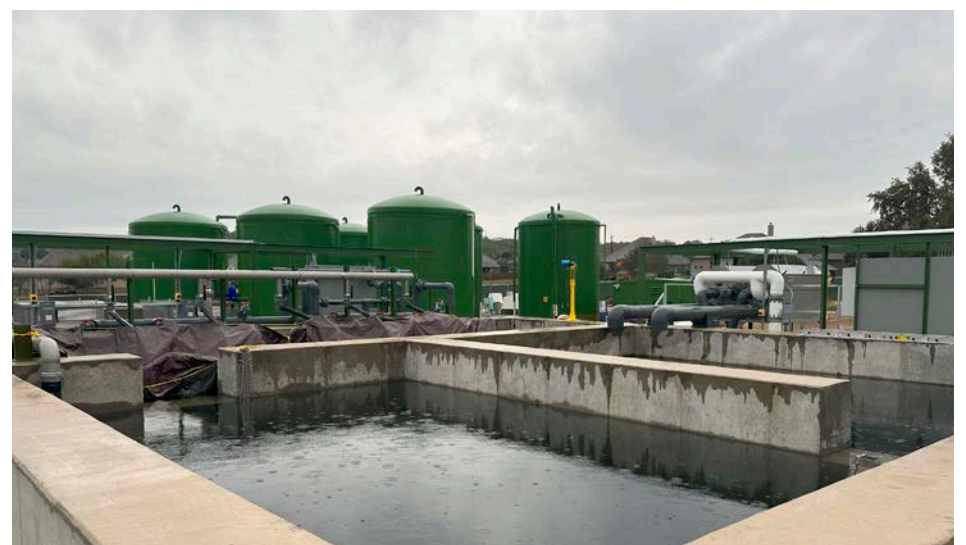
Photos above of the nearly-completed MBR plant.